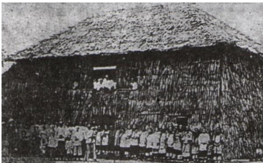
Anglo Chinese School at Sg. Merah First opened at 27 May 1903