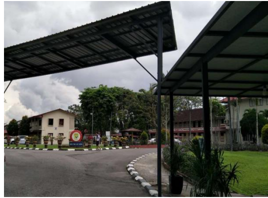
The Main Gate